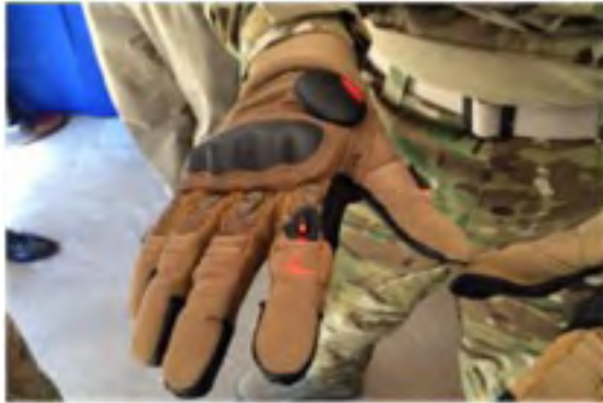
Fig 1. Glove-mounted LED flashlight

The current evolution of the “Future Soldier” is striving to advance the technology of devices designed for the dismounted soldier. It foresees lightweight, miniaturized and customized devices that enhance the specific role of each category of Warfighter. The applications extend to all areas of Military Humionics used by soldiers, including communication