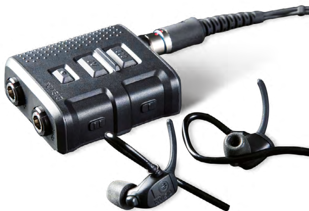
Fig 8. Multi-Com Control Unit

A second example is illustrated in Figure 8 , a multi-com control unit used to manually switch up to three audio sources to a headset. In this case the IP68 rating of the unit and its cable connectors allow it to operate under water to a depth of 20 meters. The ODU connectors shown here are mechanically keyed to prevent incorrect cable connections and color-coded to make correct selection easier.