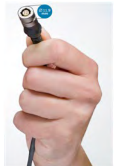
Fig 4. ODU AMC® Series connectors