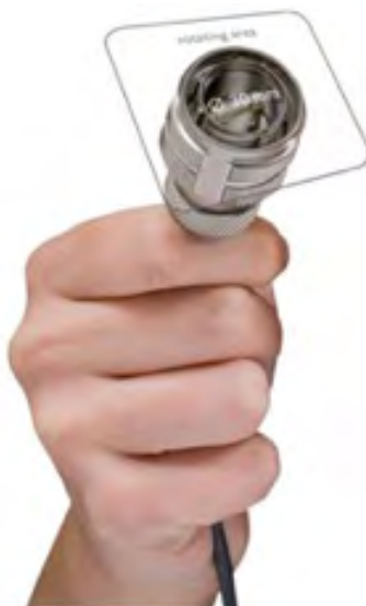
Fig 3. Typical ruggedized USB® connector*

With up to 2.5 times smaller diameter and up to 10 times smaller volume than most competitive protocol-specific connectors, ODU is clearly the superior choice with regard to miniaturization.