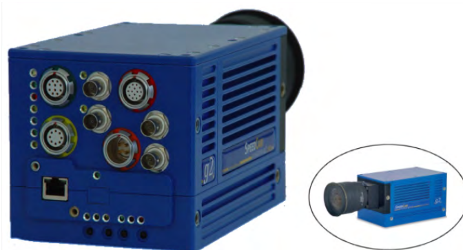
Fig 9. High-Speed Camera with multiple interfaces

Other industrial applications that place similar demands on equipment and high-speed cables include vehicle production lines, laboratory testing and measurement facilities, critical care medical systems and, of course, all types of transportation systems.