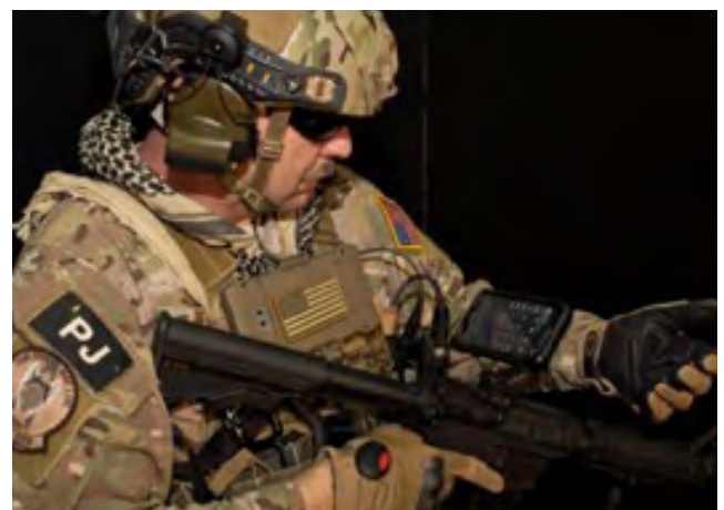
Fig 2. Pararescue Jumper with wearable devices