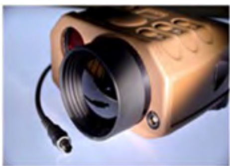
Fig 7. Thermal Imager with 10Gbps cable

Figure 7 shows a thermal imager used for observation, reconnaissance and target acquisition during both day time and night time operations. Image data is transferred