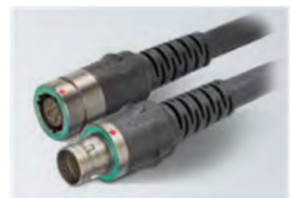
Fig 5. USB® and Gigabit-Ethernet combined*